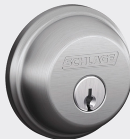
RS210F 619 Satin Nickel