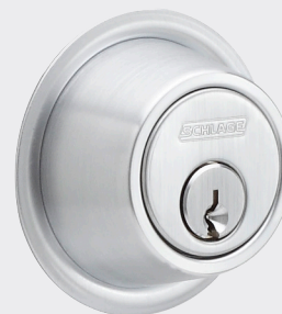
CS210 619 Satin Nickel