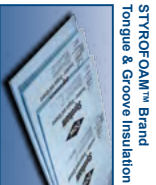
STYROFOAM™ Brand Tongue & Groove Insulation